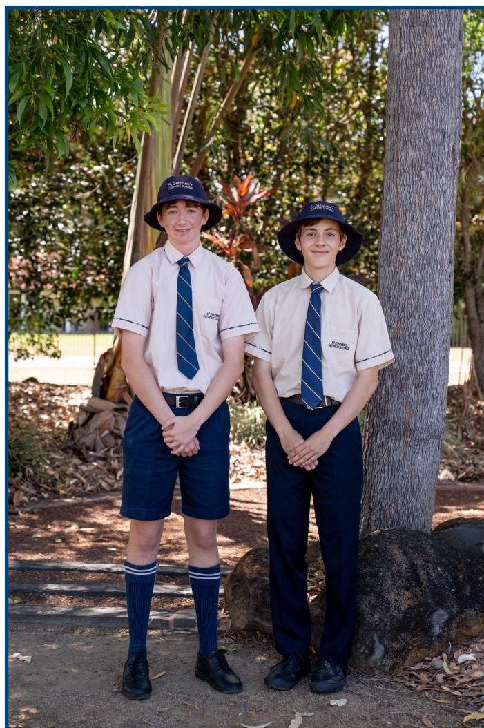
Formal uniform for Years 10 to 12